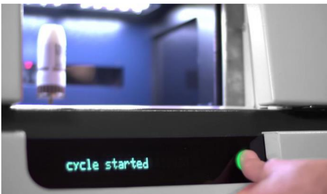
Click the image to see the movie of the entire process, which only takes a few minutes with the fast scan on SkyScan 1275.

After all settings are defined, the green pushbutton of the SkyScan1275 can be used, and all there's left to do is push, sit back, and watch the results being produced.